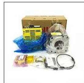
4th axis parts